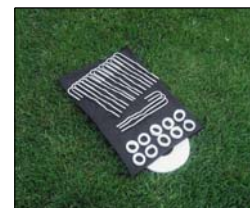
SGPe10 Velcro Soccer Net Attachment Kit